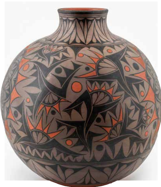
Lisa Holt (Cochiti Pueblo) and Harlan Reano (Santo Domingo Pueblo), Wildflower Jar , natural clay with pigments, 13½ x 14 in.