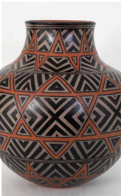
Lisa Holt (Cochiti Pueblo) and Harlan Reano (Santo Domingo Pueblo), Star Lines , natural clay with pigments, 11¼ x 10½ in.